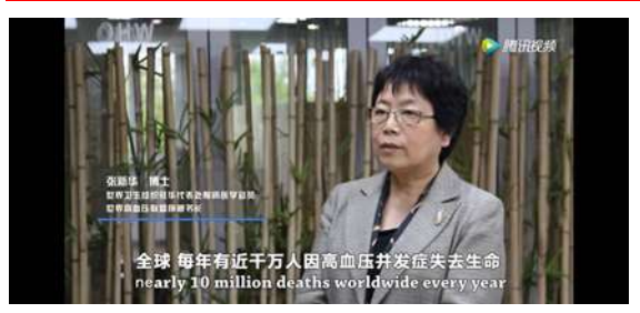
Dr. Zhang Xin-Hua

The delayed <u>World Hypertension Day</u> on 17 October 2020 is approaching! The theme of WHD2020 is " Measure Your Blood Pressure, Control It, Live Longer ". It emphasizes accurate measurement, effective control and a healthy long life! Join with us to share the message with health care providers, patients, and health policy makers, and join the actions to measure and control blood pressure for everyone.